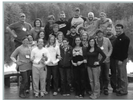
CYMT students at the Princeton Forum held in Hendersonville, North Carolina in November 2009