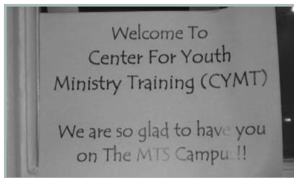
A welcomed sight upon CYMT's arrival to the Memphis Theological Seminary Campus