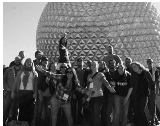
CYMT students at the Youth Worker Summit in December 2010 held in Orlando, Florida.

None of these things would have been possible without the support of investors like yourself. CYMT continues to see fruit from our labors. Many from our inaugural class are beginning their fifth year of ministry in their churches. Our alumni churches report continued growth in their ministries.